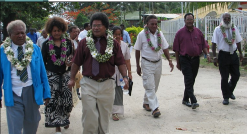
CC/EPAC Members join the Western Province Symposium held in Gizo on Nov 2008.