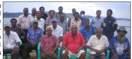
Chiefs & leaders of Gela Island during the identification of Political Communities, which the Central Province Congress nominees held on April 2008.

The team's report noted that the "people of Gela, Savo and Russell islands have similar cultures and are culturally related" and that this realization "is an important point to understand in terms of defining any political agenda for the province."