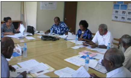
CC/EPAC Executive meets with CRU.