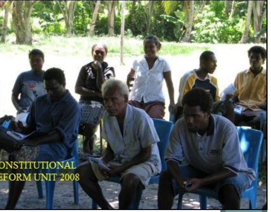
Students at Choiseul Bay P.S.S in an Awareness program carried out by Choiseul Congress Nominees.