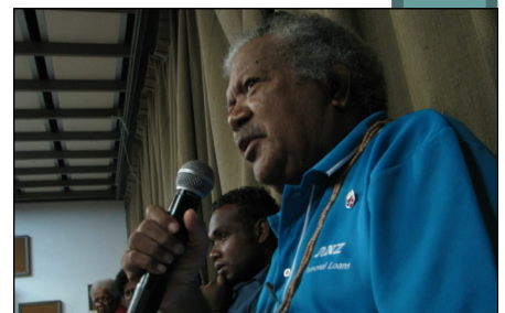
EPAC Member Sir Baddeley Devesi making a point during 1st Joint CC/EPAC Plenary in May 2009.