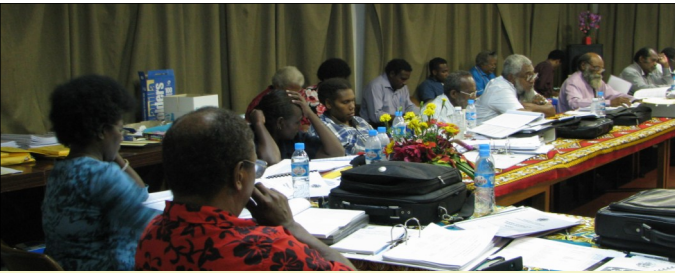
Members of the 1st Joint CC/EPAC Plenary during the meeting at Red Mansion conference in June (Top) and SIBC Conference in May (Below) 2009.