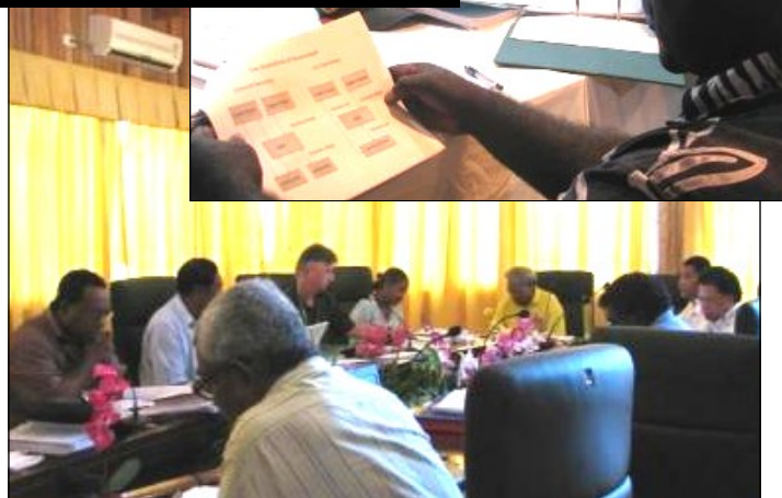
Federal Political Systems and Powers theme committee looking at a proposed Federal Government structure during one of the committee's sessions in October 2008, together with members of Federal Foundation committee (Right). Members of the Public Finance and Revenue Sharing during one of the committee's sessions in September 2008. (Below)

This committee met simultaneously with Federal Foundation from 20 October till 7 November 2008. It submitted its report to CRU on 25 November 2008. ✍