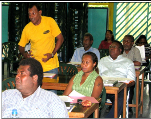
Representatives of Isabel at CYP Conference, 18 April 2008.

On April 2 & 12, the team held consultative meet-