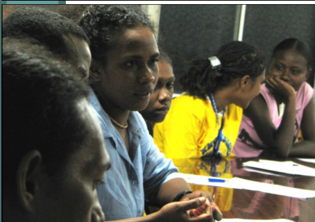
A youth raising a question during the Honiara Nominees' last meeting with youth members on the Identification of political community exercise on February 2008.