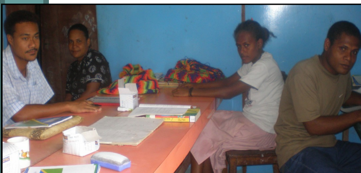
Youths of Central Province during the Political Community identification exercise at the province in April 2008.