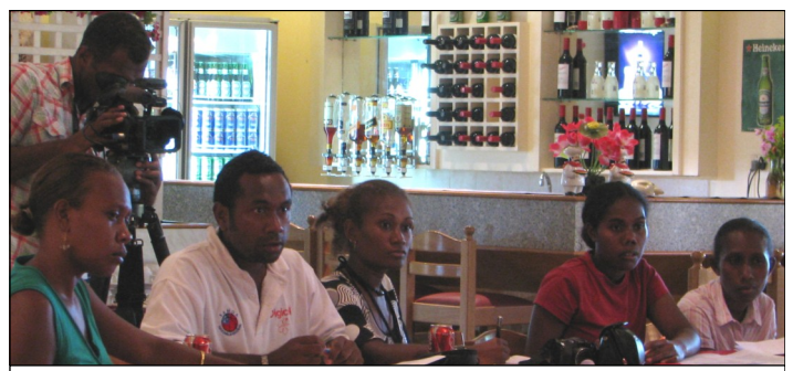
Media personnel in a press conference between 3 Theme Committees & the local media on September 2008 at Casablanca, IBSH.