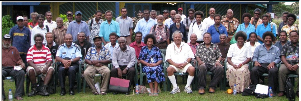
Civic leaders of Guadalcanal meet with CC Guadalcanal Nominees & EPAC members in June 2008.

(EPAC Members) to arrange consultation meetings with Guadalcanal Provincial Assembly; workers from Guadalcanal, chief and women leaders living in and around Honiara on 5 th of June 2008; and with about 1,500 followers of the Qaena-Alu Movement in 25 th October 2008 during the commemoration of the Paramount Chief Moro at Komu-